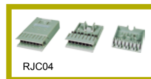
4 pair 110 patch plugs